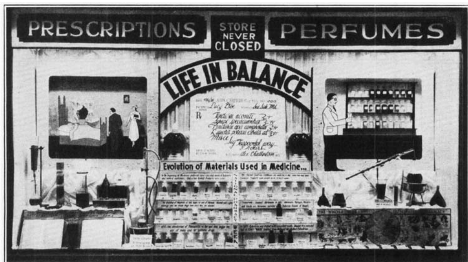
LIFE IN THE BALANCE.

THE PHARMACY WEEK PRIZE WINDOW (ROBERT J. RUTH MEMORIAL) AWARDED TO MORGAN AND MILLARD, INC., BALTIMORE, MD.